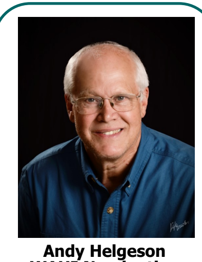
WAHI Nomination and Elections Chair

Now is the time to give back to your association!